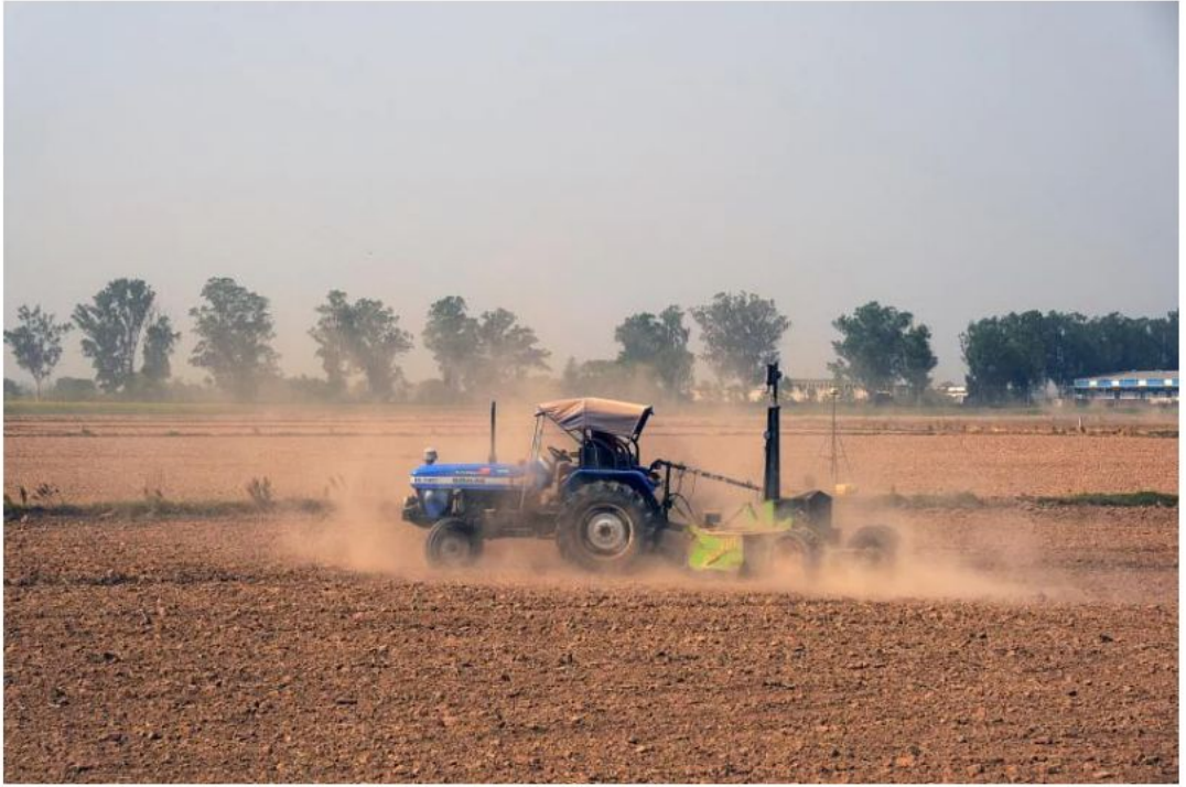
The government will suspend overseas sales to manage its food security, according to a notification dated May 13.