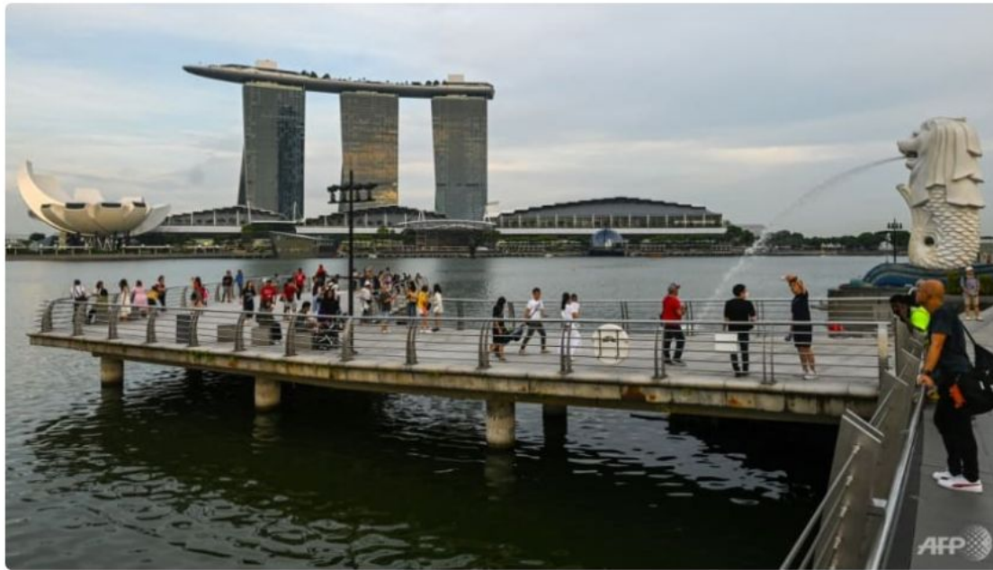
People gather along the Marina Bay waterfront in Singapore on Jun 1, 2022.

23 Jun 2022 01:33PM (Updated: 23 Jun 2022 08:16PM)