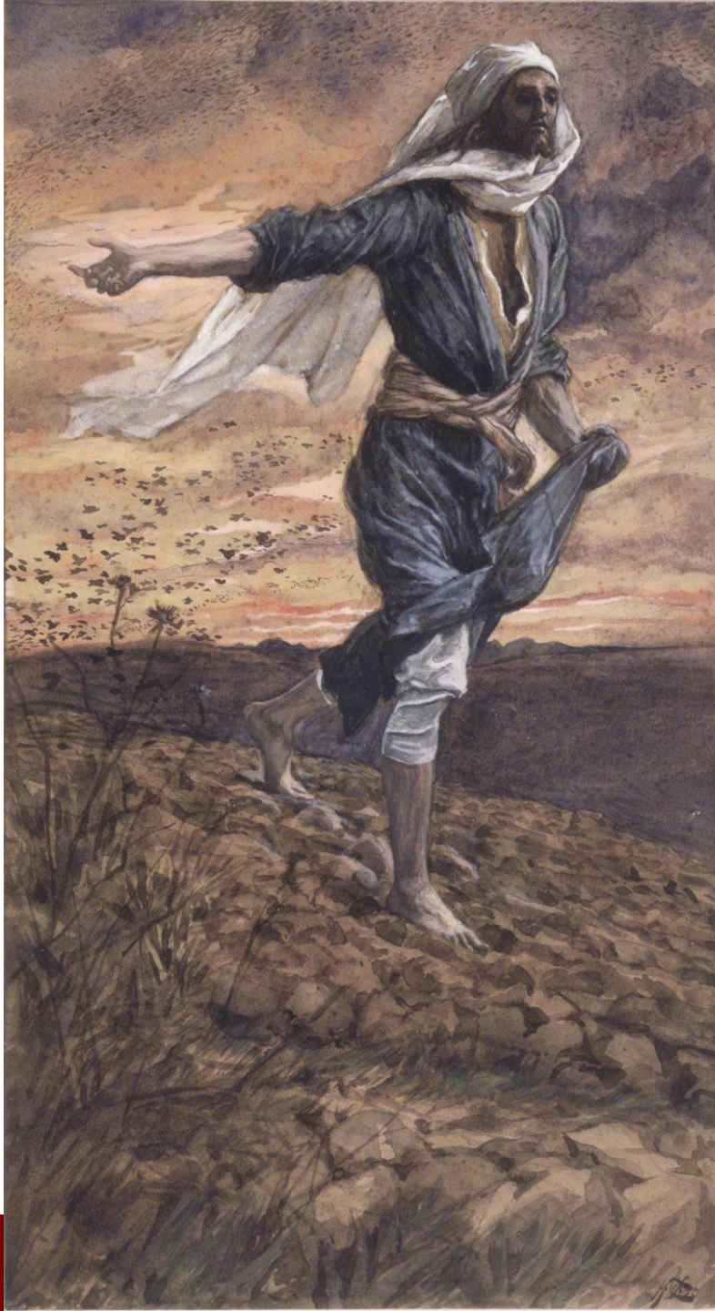
"The Sower" by James Tissot (1886-1894)