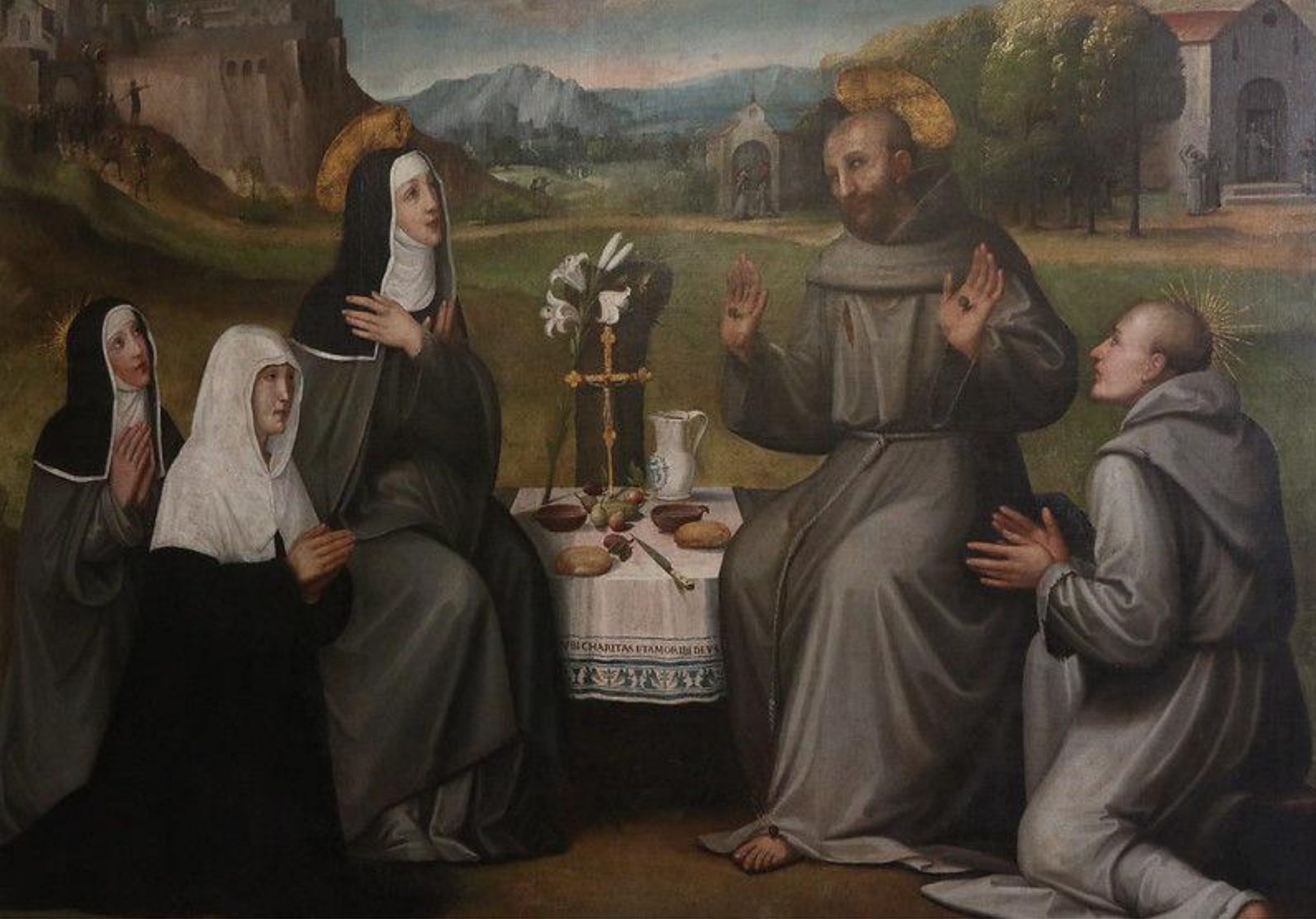
Picnic of St. Claire with St. Francis: