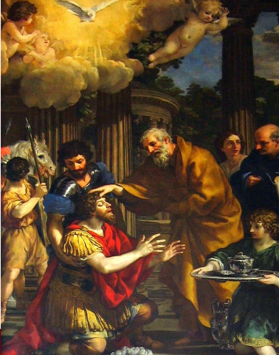
Ananias Restoring the Sight of St. Paul by Pietro da Cortona (c.1631)